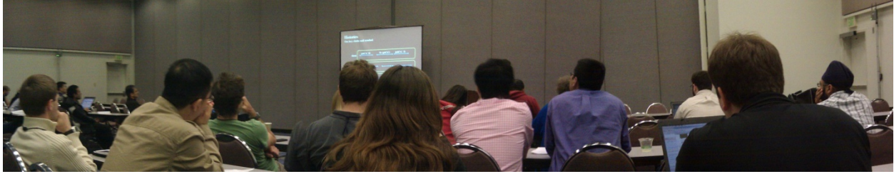
Figure 3: Security and consistency session.

Message passing algorithms for networks always get some attention. The paper “ Distributed Graph Coloring in Few Rounds ” by Kothapalli and Pemmaraju, presented an optimum distributed algorithm that colors the nodes of an oriented graph with a small number of colors while bounding the number of rounds of computation. Another interesting paper was “ Toward more Localized Local Algorithms: Removing Assumptions concerning Global Knowledge ” by Korman, Sereni and Viennot. They proposed a rather general method to remove the reliance of processors on global information of the network such as the maximum degree or the number of nodes.