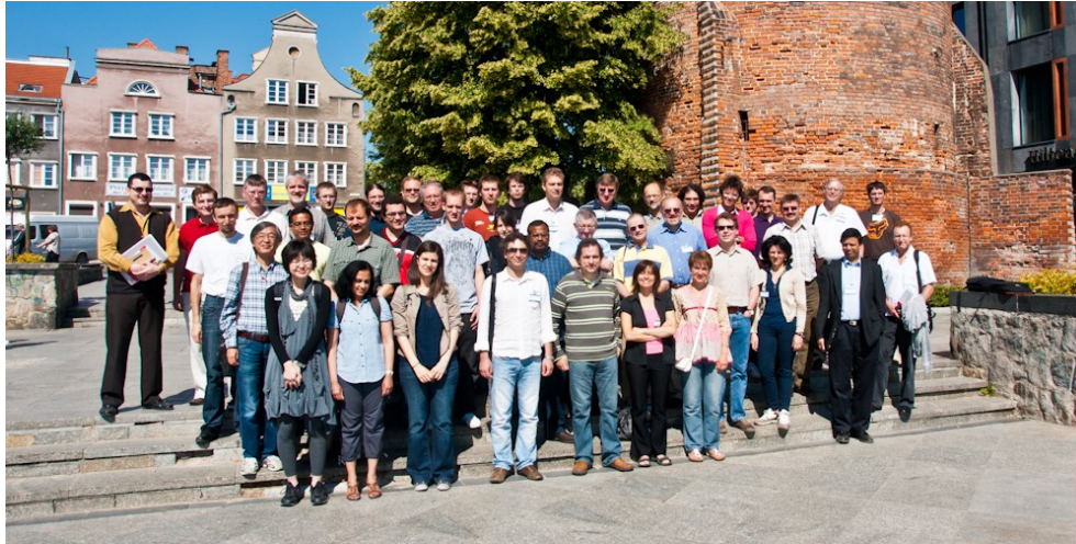
Participants of SIROCCO 2011 in front of the medieval city wall, next to the conference hotel