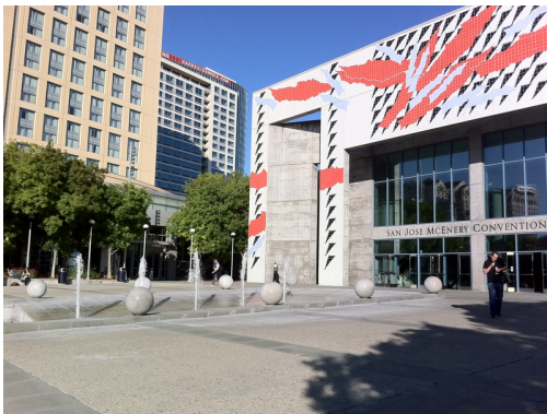
Figure 1: San Jose Convention Center.

The 30th ACM SIGACT-SIGOPS Symposium on Principles of Distributed Computing (PODC 2011) was held on June 6-8, 2011, in San Jose, California , as part of the 5th Federated Computing Research Conference (FCRC). 34 regular papers and 31 brief announcements presented in this conference were selected among 129 regular submissions, and 34 additional brief announcement submissions. The conference took place at the San Jose Convention Center.