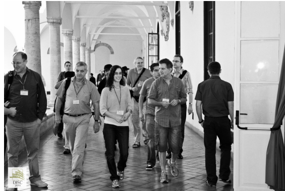
Sapienza University’s School of Engineering complex, outside and inside.