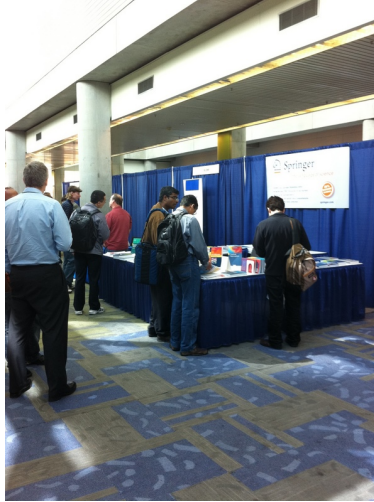
Figure 4: The break time between sessions

There were many other notable and excellent presentations and papers on diverse subjects presented at PODC this year and this review only describes a small subset of those presentations most related to my research interest.